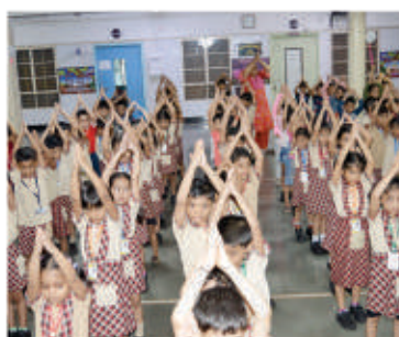
Yoga Day Celebration