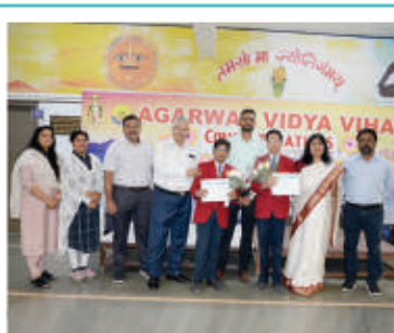
Winner of CBSE National Science Exhibition